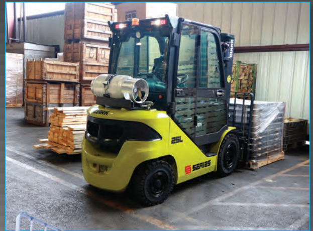
*Shown with optional cabin